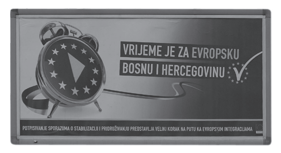
Figure I: An election poster from Bosnia-Herzegovina reading, "It's time for European Bosnia-Herzegovina." The statement at the bottom says, "Signing the Stability and Association Agreement is a large step forward on the road to European integration." (Tuzla, September 2008)

If we put things in the context of Dimitrij Rupel's statement quoted earlier, about the "unproblematic" and "problematic" subjects that have difficulties with European values, it is obvious that the political elites of the Western Balkan countries simply reproduce the discourse coming "from above," without problematizing it or adapting it to the citizens of their countries. Those who do problematize it and draw attention to the disputability of such discourse and relationships echoed by it are – much as "in the West" – various marginalized subjects with only weak socio-political influence: workers, immigrants, artists and their organizations (see also Figure 5), but they, as Rupel has established, "are not a problem."