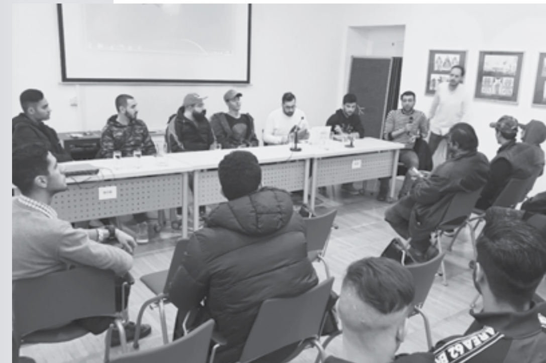
Symposium "Promoting integration of migrants into society through integration into the labor market", November 27, 2019, Slovenian Ethnographic Museum.