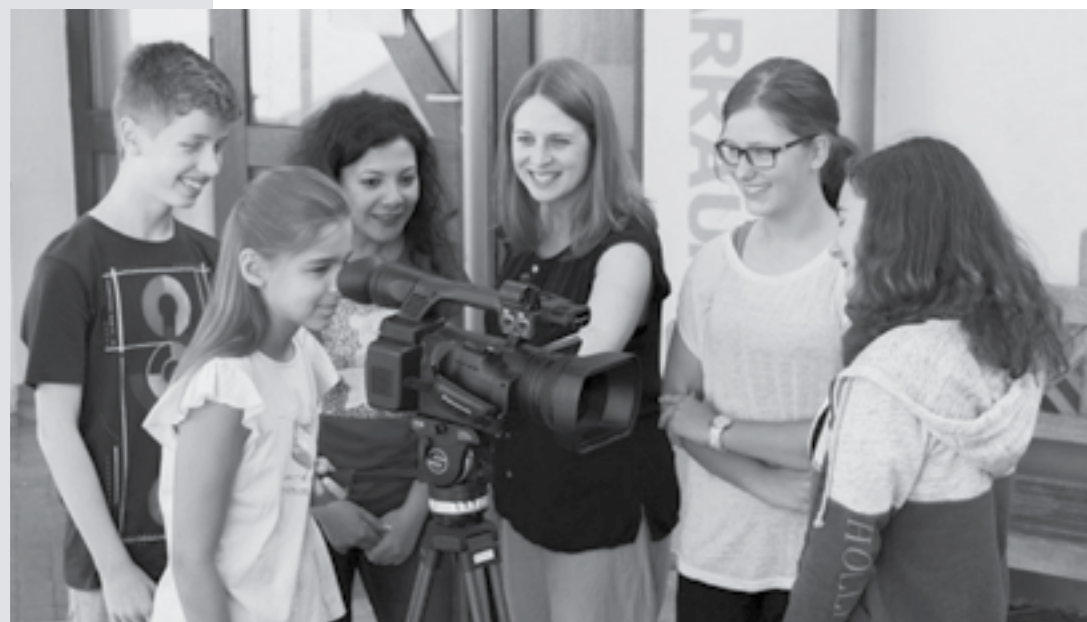
Within the MEET project students gained knowledge while creating media content.