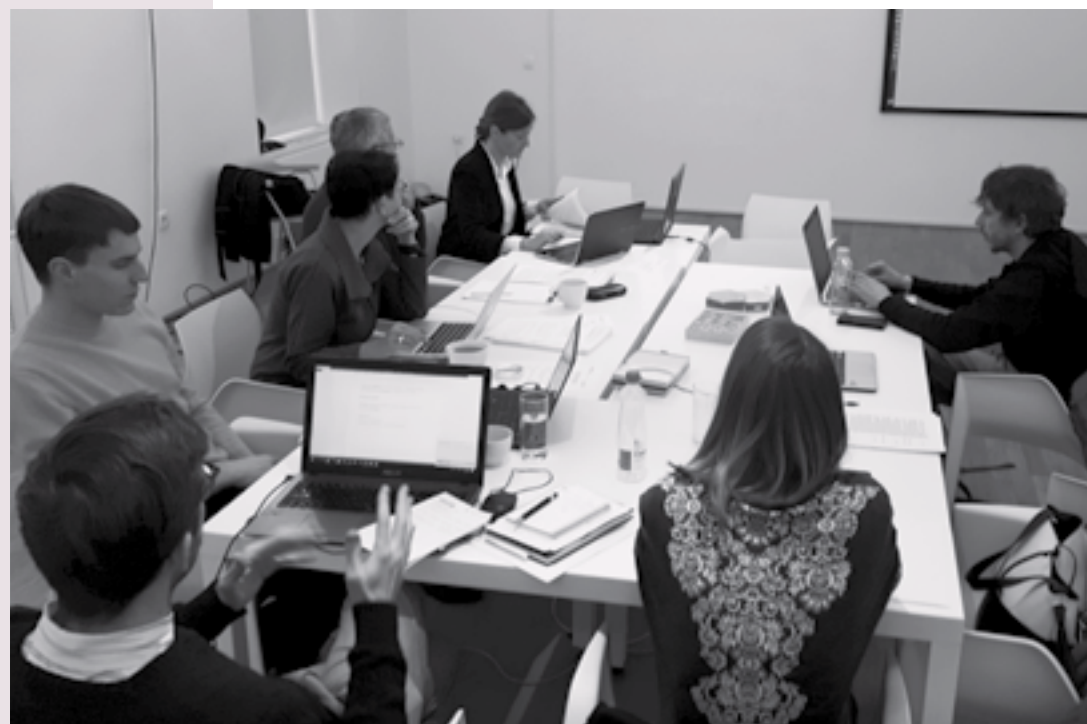
Kick-off meeting of the research group 'Political and Media Populism: "Refugee crisis" in Slovenia and Austria', 3. and 4. January 2019, Ljubljana.