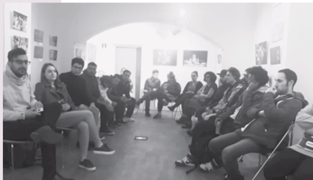
Consultation meeting for migrants, asylum seekers and refugees, February 27, 2019, Hostel Celica.