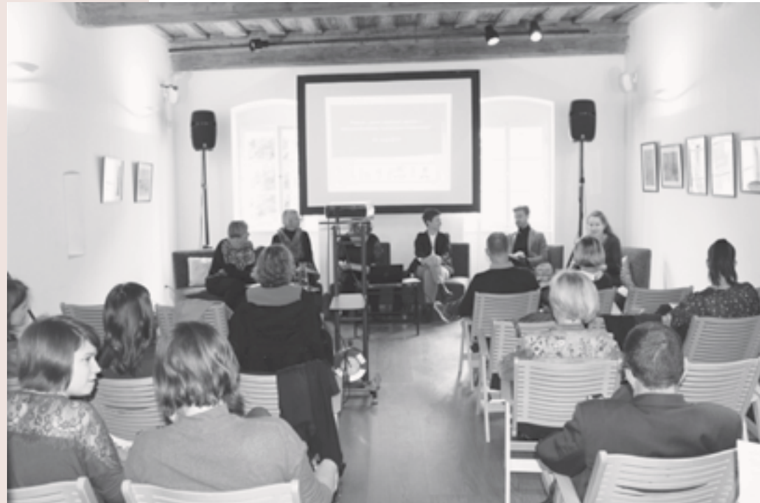
National round table 'Challenges of gender equality in primary school career orientation', Trubarjeva hiša literature, May 21, 2019.