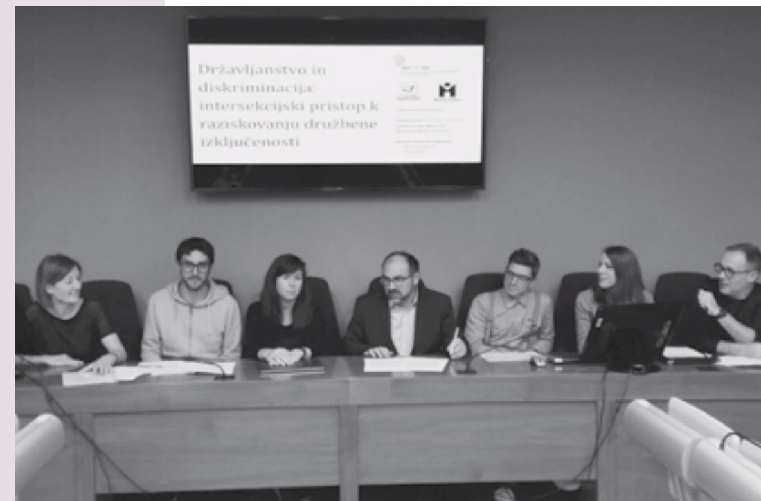
Scientific Symposium 'Discrimination and Intersectionality: An Aspect of Political Intersectionality', 20 November 2019, Faculty of Arts in Ljubljana.