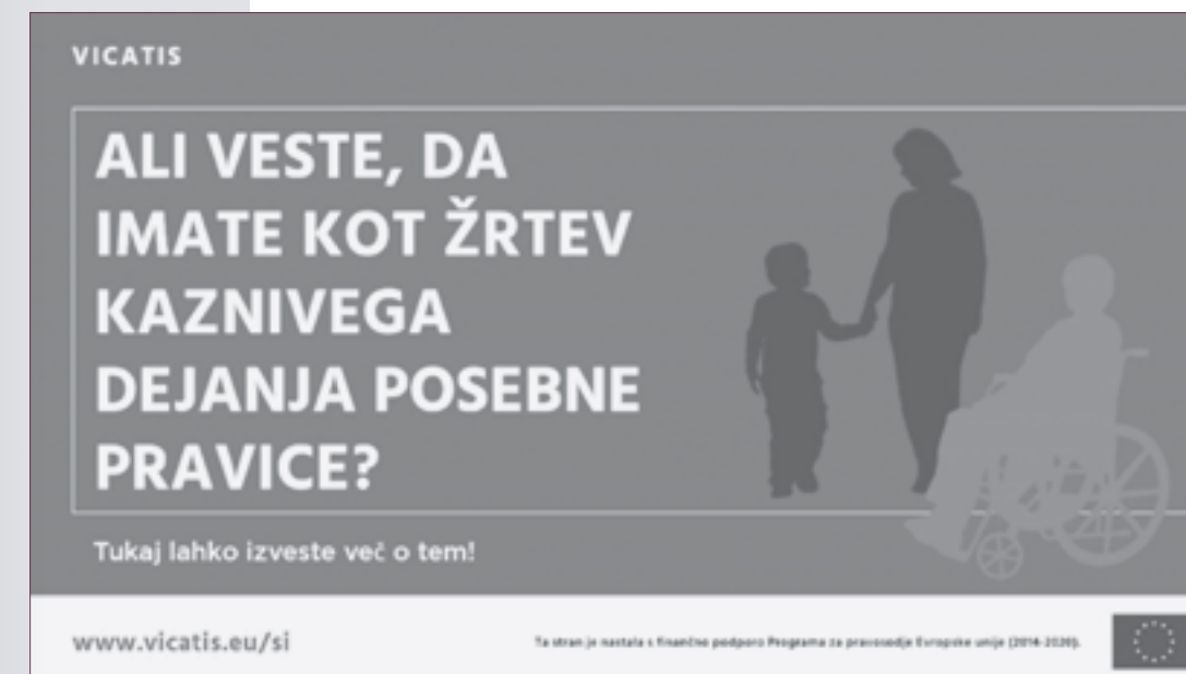
Social media campaign: Presentation of a website providing information for victims of crime and misdemeanors: http://www.mirovni-institut.si/?galleries=vicatis-transparenti .