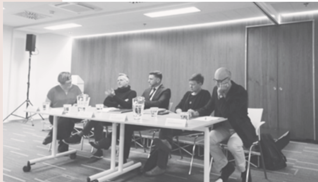
Meeting 'Dedicated Businesses - Challenges in the Work Environment', 11 September 2019, Ljubljana.