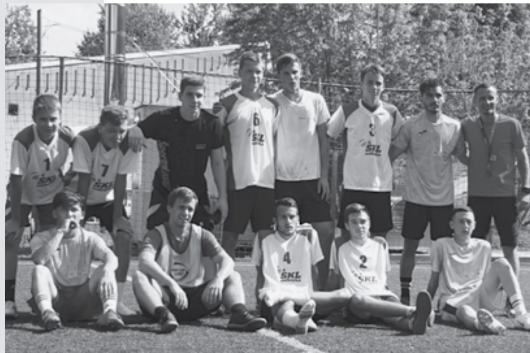
On September 19, 2019, we held a workshop on tolerance, equality and sameness at Gymnasium in Ravne na Koroškem. The meeting ended with a football match between students and asylum seekers from Postojna.