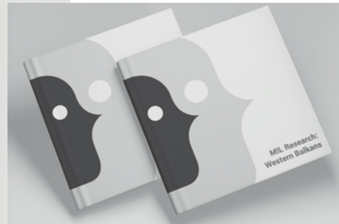
Within the project Media for Citizens, Citizens for Media six books were published with the findings of the research on media and information literacy development in the Western Balkan countries.